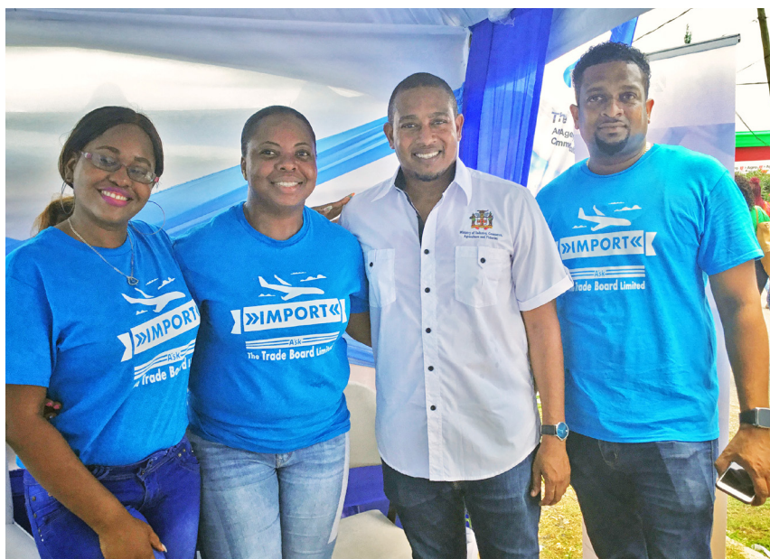
Minister of State in the Ministry of Industry, Commerce, Agriculture and Fisheries, Floyd Green (second right), is flanked by the Trade Board Limited staff on Tuesday, August 6, 2019, at the Denbigh Agricultural Show.

The JTIP team outlined the key features of the portal to patrons at the Denbigh Agricultural, Industrial and Food Show held on August 3-6, 2019 at the Denbigh Agricultural Showground in Clarendon, inside the Trade Board Limited Booth.